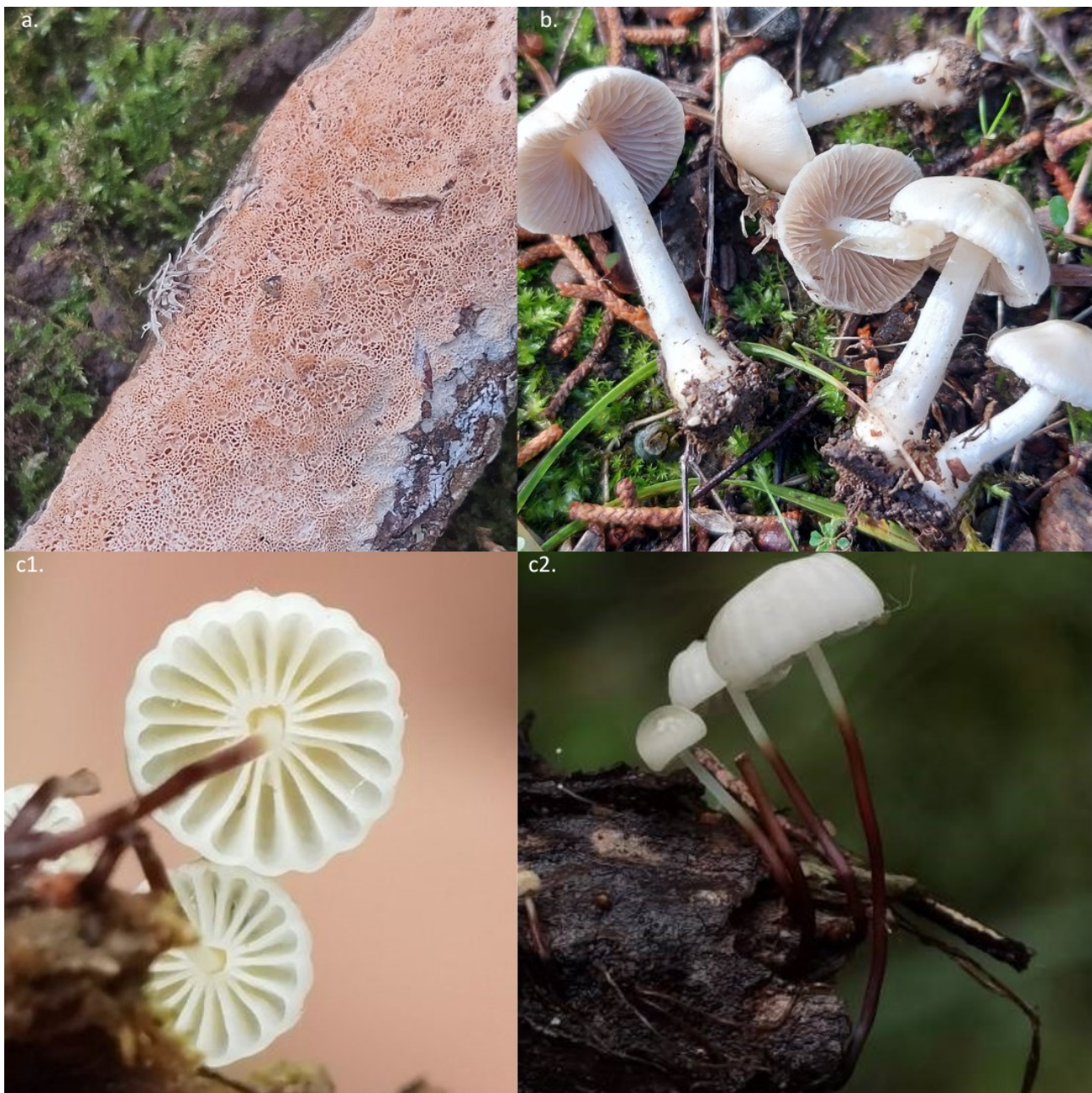
Figure 2 New data for Macedonian mycobiota: a. Schizopora flavipora , b. Inocybe muricellata , c1.-c2. Marasmiellus vaillantii (hymenium and basidiocarps, respectively).

Biology, Faculty of Natural Science and Mathematics in Skopje). Notes on the location, coordinates, altitude, habitat, substrate type and date were taken for each collection. The lab work included using various literature for determination of the specimen based on their macro- and microscopic features, such as: Breitenbach & Kränzlin (1981, 1986, 1991, 1995, 2000), Calogne (1998), Galli (2001), Galli (2003), Kränzlin (2005), Knudsen & Vesterholt (2012). Microscopical analyses were conducted using reagents, such as KOH, Melzer, Lactophenol cotton blue and Congo Red. Index Fungorum 2023 was used to provide the current name